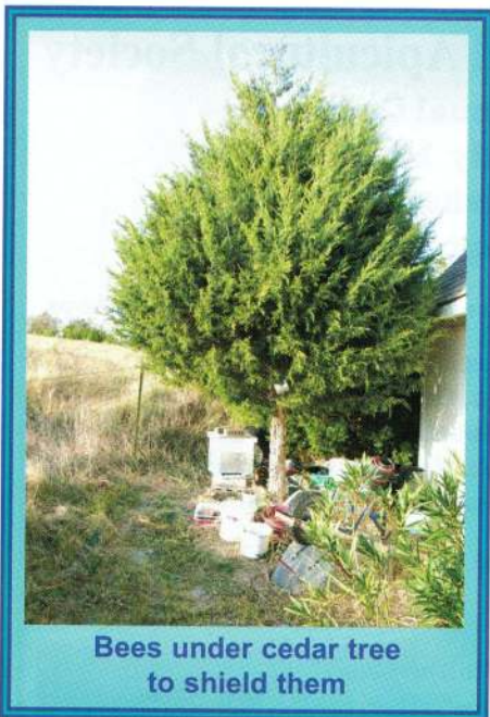
Bees under cedar tree to shield them

some composites along the roadsides and in random gardens. Mostly, the bees were at the entrances of their hives and interested in protecting their season's hard labor.