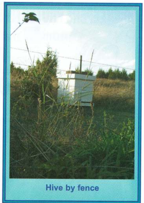
Hive by fence

As a bee club, the Collin County Hobby Bee Association has many talented individuals who are more than willing to support their club and make the programs work well. I know that there must be many hours spent by the officers and directors planning the future educational efforts, as well as finding ways to finance the scholarships and queen programs. What makes this group unique is that it incorporates these talents into a team effort, and the group is more interested in the success of the program, rather than one individual looking good at the expense of other members. There are other clubs in the country that operate in ways similar to this one, but the youth programs and non-beekeeper outreach make the Collin County group worth study and a visit by other beekeeper organizations. Any of the people I have mentioned in this article are likely candidates for an invitation to speak at other groups about the educational programs of Collin County Hobby Beekeepers. Collin